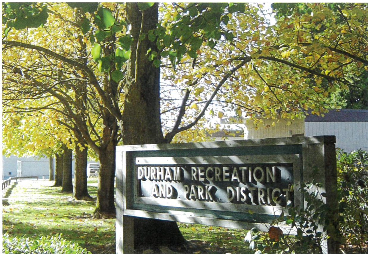
DURHAM RECREATION AND PARK DISTRICT