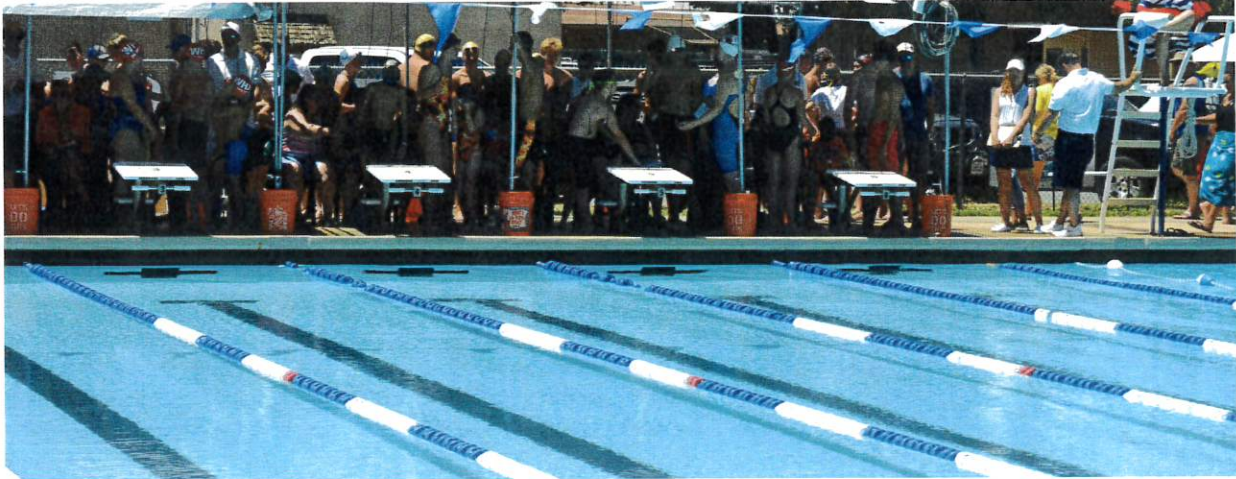
DWIGHT BRINSON SWIM CENTER

Dwight Brinson Swim Center. In March of 1975, DRPD Board of Directors approved purchase of land from the Durham Unified School District for the purpose of building a community pool. The pool was built, at a cost to the District, of approximately $310,000 and was officially opened to the public in June of 1976. Since that opening day 46 years ago. The Dwight Brinson Swim Center has been the home to a long list of District sponsored aquatics programs, as well as the Durham Dolphins and Durham High School Swim Teams.