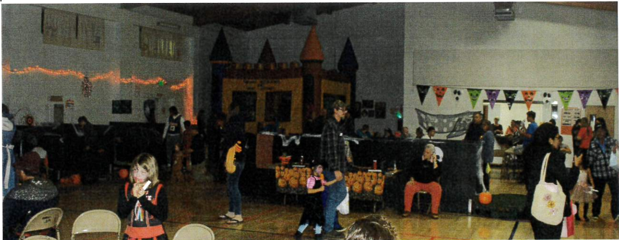
DURHAM VETERANS MEMORIAL HALL

Durham Veterans Memorial Hall: The Veterans Memorial Hall was built in 1957, and is host to the Durham American Legion Post No. 673 and the Durham American Legion Auxiliary for meetings and functions. The District assumed operations of the Hall in 1992. The District currently maintains and uses the Hall for District sponsored special events, programs, and meetings. The Memorial Hall consists of a kitchen, large meeting room, Legion meeting room, main floor and stage area, and is available for use by the public.