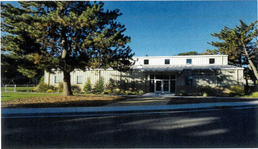
JIM BRINSON ACTIVITY CENTER - Gymnasium Space

Jim Brinson Activity Center: In the Spring of 2017, the District began construction of a new 7400 sq. foot multi-purpose activity center located at the south end of the 4.8 acre parcel, adjacent to Ravekes Park. The building was opened to the public in the fall of 2017. The new facility provides space for the District sponsored after school program and indoor recreational programs including basketball, volleyball and pickleball. The facility is available for use by the public for: team practices, drop-in play, birthday parties, meetings/trainings, dances, community events and more.